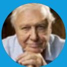
SIR DAVID ATTENBOROUGH PATRON

ALL OUR ENVIRONMENTAL PROBLEMS BECOME EASIER TO SOLVE WITH FEWER PEOPLE, AND HARDER - AND ULTIMATELY IMPOSSIBLE - TO SOLVE WITH EVER MORE PEOPLE