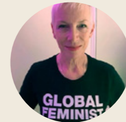
Annie Lennox , The Circle NGO Founder

“CHANGE IS POSSIBLE, BUT IT IS NEVER EASY. WE HAVE TO BE RESILIENT AND DETERMINED.”